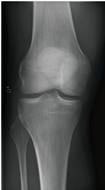
Normal Knee. Public domain