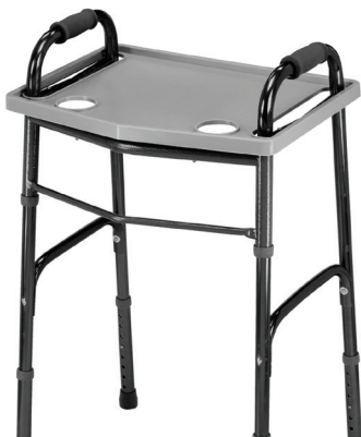
Walker with Tray.