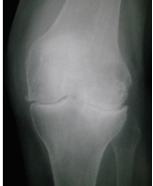
Osteoarthritic Knee.