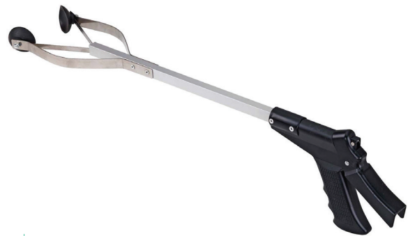
Reacher, or Grabber.