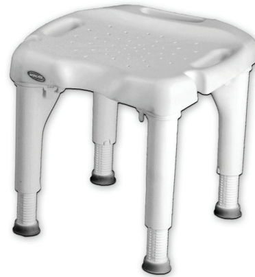
Shower Chair.